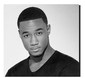
Jessie Usher The Boys – A-Train Independence Day – Dylan Hiller Level Up – Lyle